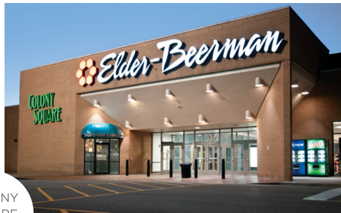
COLONY SQUARE MALL